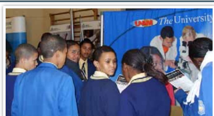
UNAM at the Karas Career Fair

Meanwhile, some of the Afrikaner breeds at Neudamm will be auctioned at the Namibia Genetics Large Stock Auction on 28 August 2009. The faculty will be running an Afrikaner Cattle Judging Course at the Neudamm campus to equip farmers and interested members of the public with ideal characteristics of Afrikaner cattle.